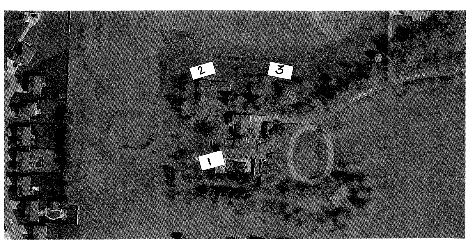
agery ©2023 Airbus, Maxar Technologies, Map data 50 ft 2023