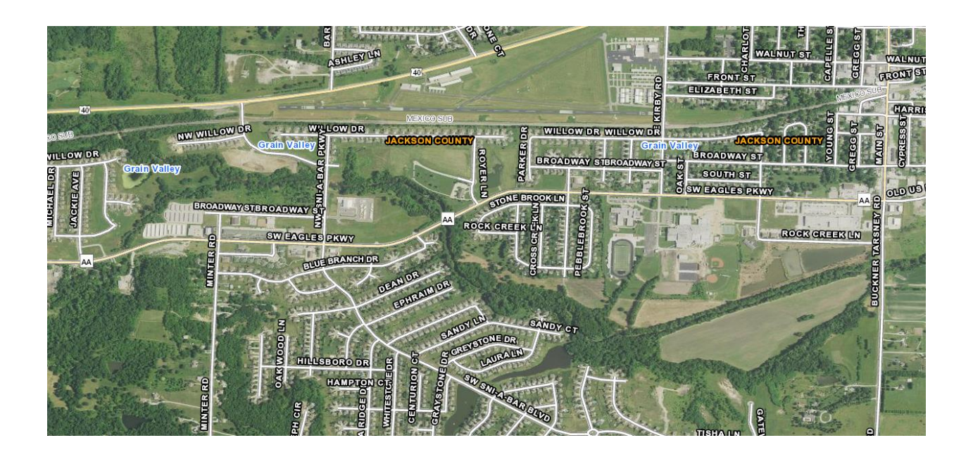
Exhibit A - Location of Project