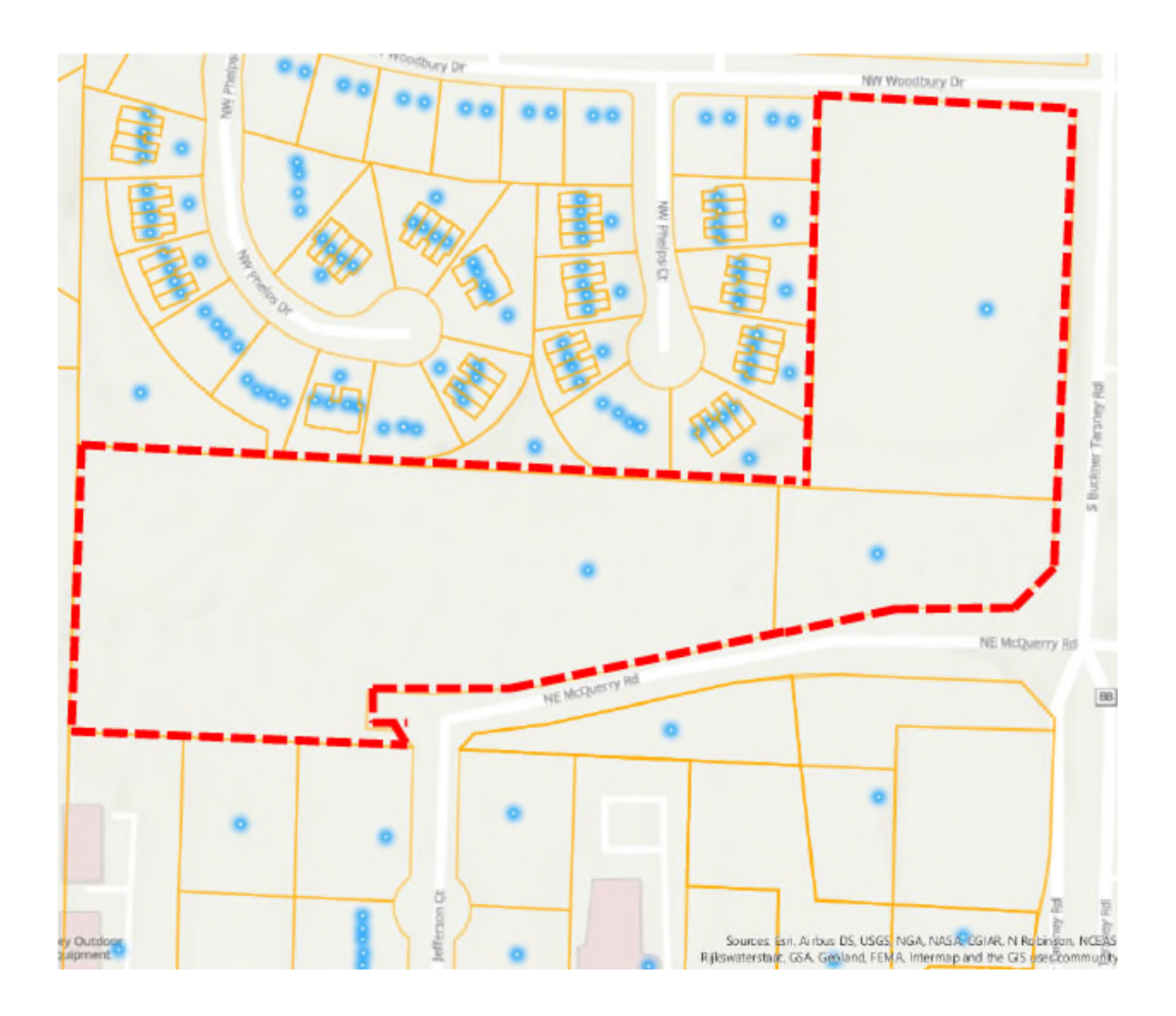
EXHIBIT 1 to Five Year Management Plan DISTRICT MAP