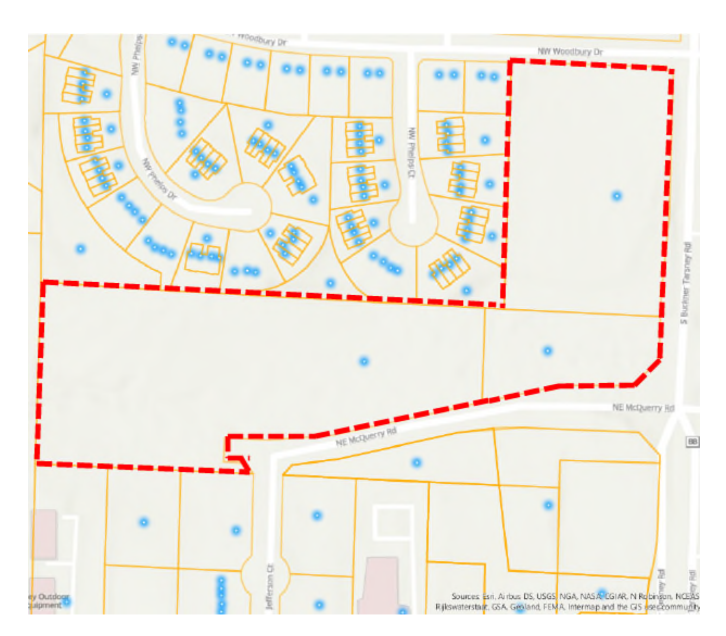
EXHIBIT A-2 BOUNDARY MAP OF THE CID