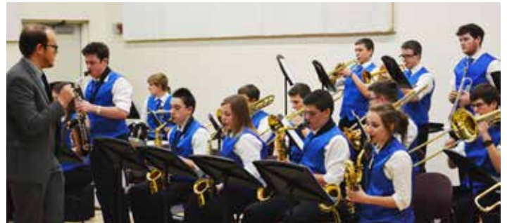
GVHS Jazz Band playing at a Senior Citizens' Luncheon

Most of the meals served at the luncheons are prepared by the Grain Valley School District. City staff, elected officials, Grain Valley High School students and school