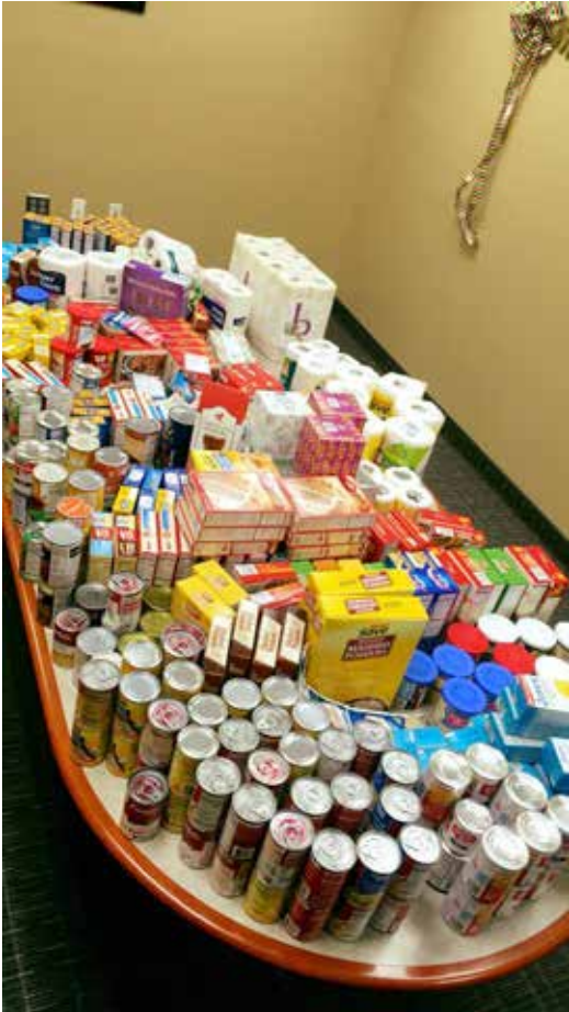
Donations collected last December for GVAC by City staff

The Grain Valley Assistance Council (GVAC) provides food, clothing and other assistance to more than 100 families each year. They collect food items and toiletries year round to help those families. However, as the holiday season approaches, they have an even greater need for specific items to help brighten the holidays for these local families. Each year, the GVAC provides families with a basket for Thanksgiving and Christmas, which contains food items they can utilize to prepare a holiday meal. Additionally, they set up an “angel tree” at the City’s Holiday Festival at Armstrong Park with specific items that have been requested by families for Christmas gifts.