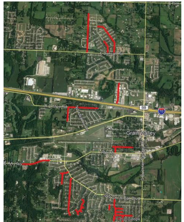
Road improvements 2: Coming Soon