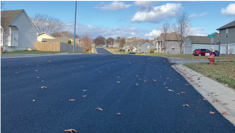
Meadow Drive in Fall 2020

Due to this growth, the Board of Aldermen has strategically focused resources towards road improvements. After the Community Development Department conducted a pavement assessment in the Spring of 2020, they were able to prioritize which roads needed more immediate attention, though many were in need of repairs. Due to the rapid growth of the City two decades ago, many of the roads were established at the same time, which is why needed repairs on many became evident at the same time. The pavement assessment helped to create